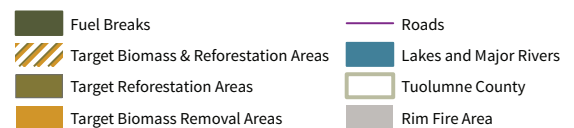
CWRP PROJECT MAP - December 2017

The projects will serve as a model to proactively plan and think about resilience differently in their communities.